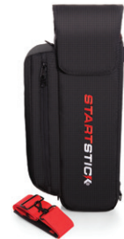
StartStick 15 Carrying Bag P/N 100231