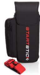
StartStick 10 Carrying Bag P/N 100230