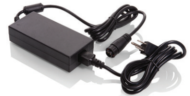
Wall Charger (Type B) P/N 100800