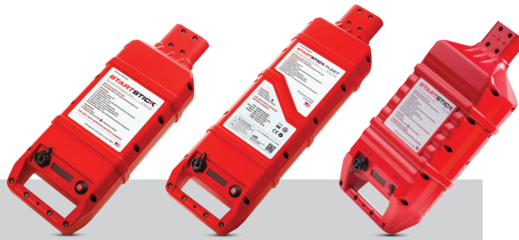
StartStick 10 P/N 100154